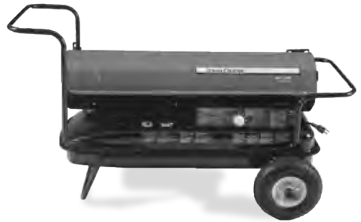
JOHN DEERE KEROSENE SPACE HEATER

** BONUS KEROSENE SPACE HEATER TO BE GIVEN AWAY AT SUNDAY MORNING SESSION! MUST BE PRESENT TO WIN! **