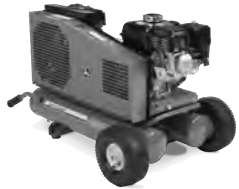
JOHN DEERE COMPRESSORATOR