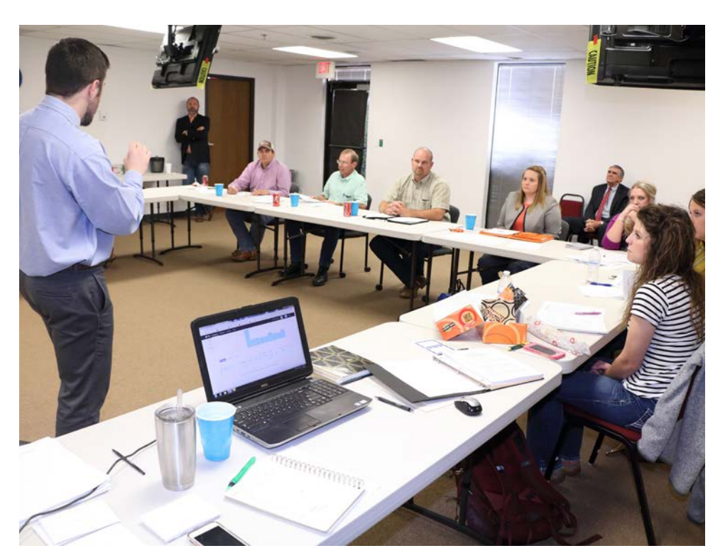
LEAD Academy Session 1 participants learn about using their leadership skills to set priorities and goals in the future.