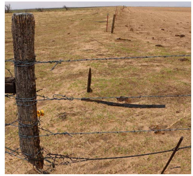
A burned fence post marks where the devastating fires crossed northwest Oklahoma.

For children and family consultation, please contact Melinda Schuster, LPC in Woodward at (580) 254-5322 or Western Plains Youth and Family Services, Inc. (580) 254-5322.