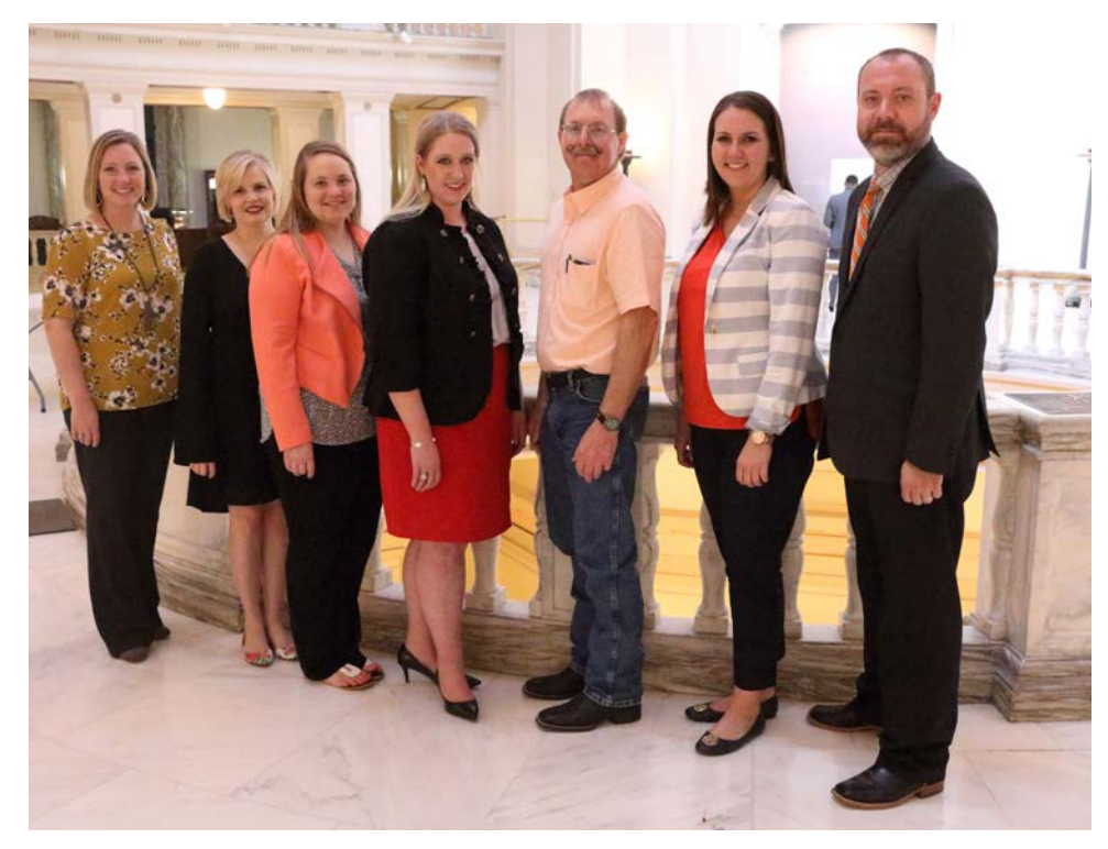
LEAD Academy Session 2 allowed participants to tour the Capitol and hear from state legislators. They wrapped up the day meeting with their legislators discussing concerns for local areas.