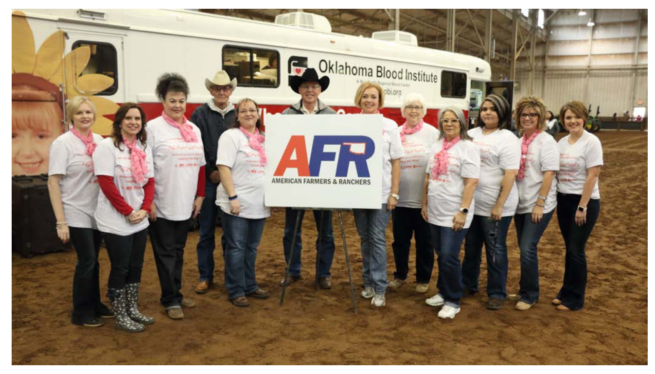
We so appreciate all of the volunteers at the 2017 OYE Women's Cooperative Blood Drive.