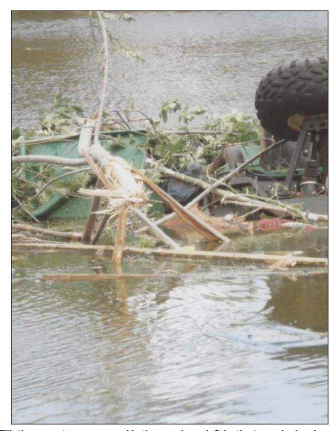
The Elliotts included a basement with a reinforced safe room in their new home, which they have used several times since the 2011 storm. The Elliot's property was covered in the wreckage left by the tornado, leaving flipped tractors and cars in fields and ponds.