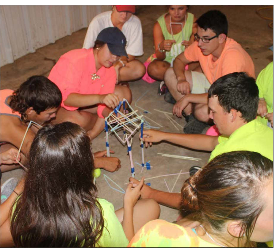
Each year the AFR/OFU Leadership Summit includes activities which promote team building and cooperation designed to grow each participant's strengths and enhance their leadership skills for future educational and professional opportunities.