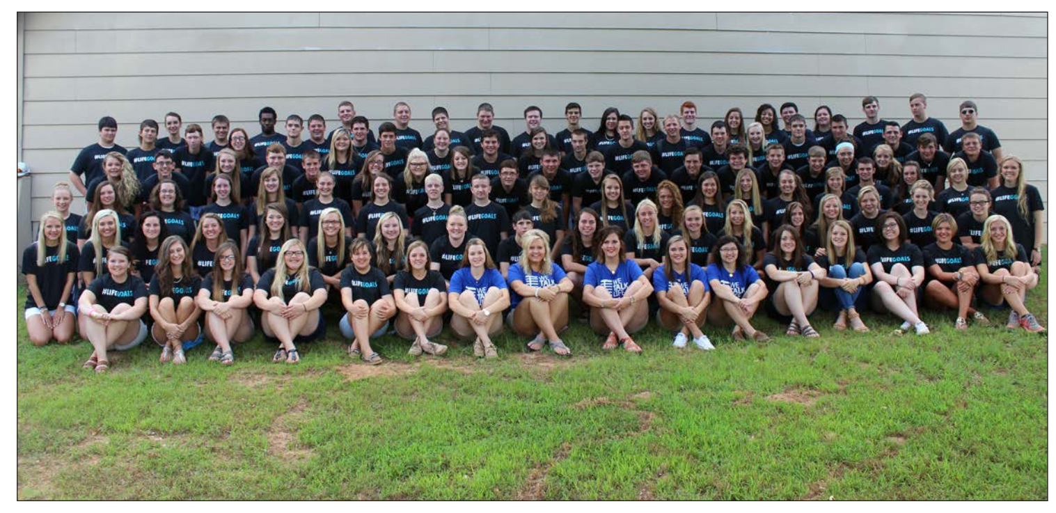
The 2015 Leadership Summit was the most attended in the annual retreat's history with more than 160 students attending.

"We are proud to invest in the future of Oklahoma through these