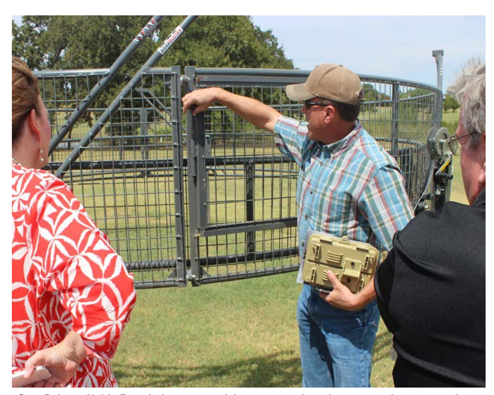
Sam Roberts Noble Foundation tour participants were given the opportunity to see a demonstation of the cutting edge trapping system called the BoarBuster.