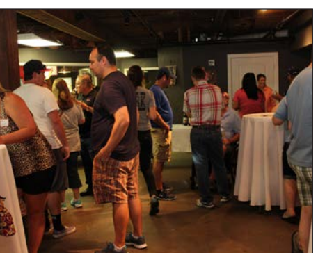
Attendees of the 2015 AFR/OFU LEAD Kick-Off enjoyed socializing before the Oklahoma City Dodgers baseball game at Put A Cork In It Winery in Bricktown.