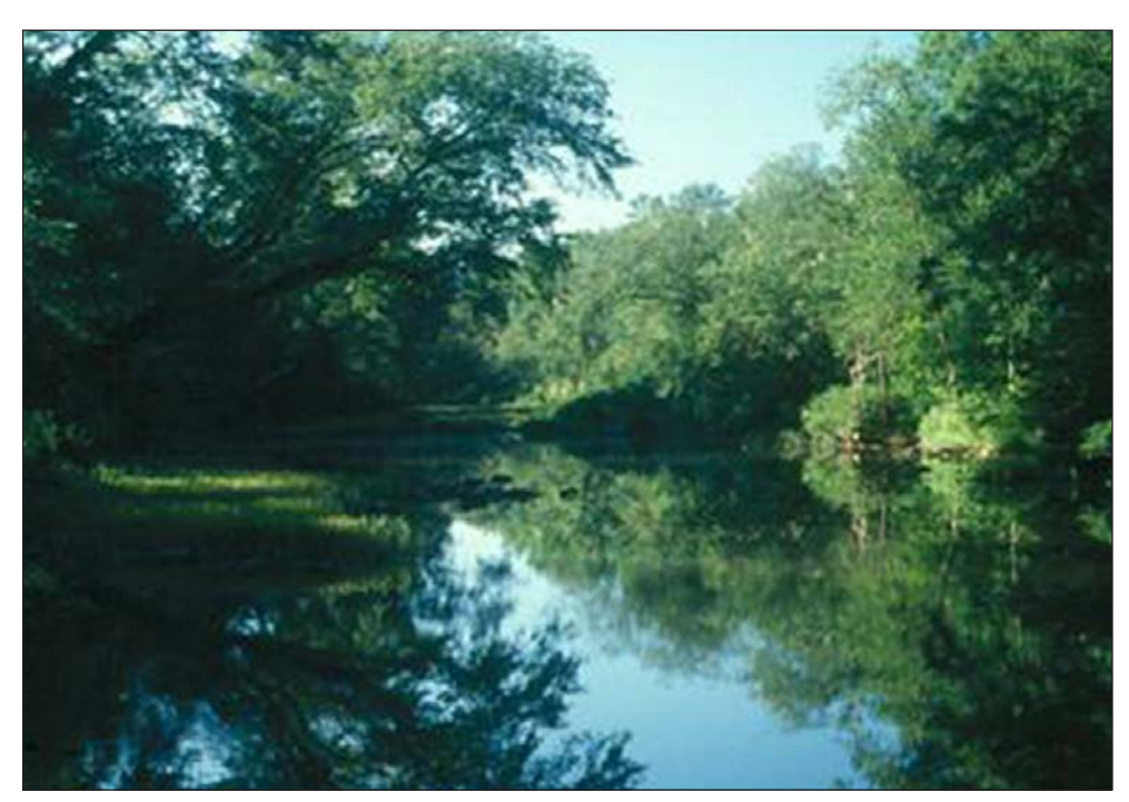
In May communities across northwest Oklahoma developed a plan for water development and reliability.