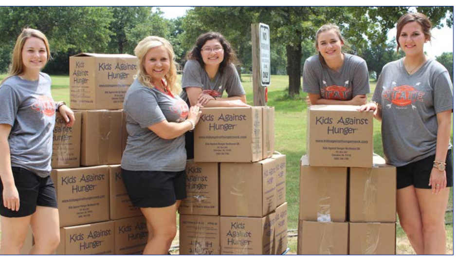
Summit attendees packaged more than 100,000 meals for Kids Against Hunger.