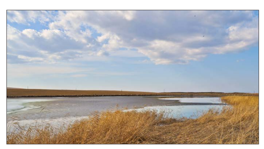
Since late May, many states and trade associations have protested the WOTUS rule that establishes federal control over domestic bodies of water.