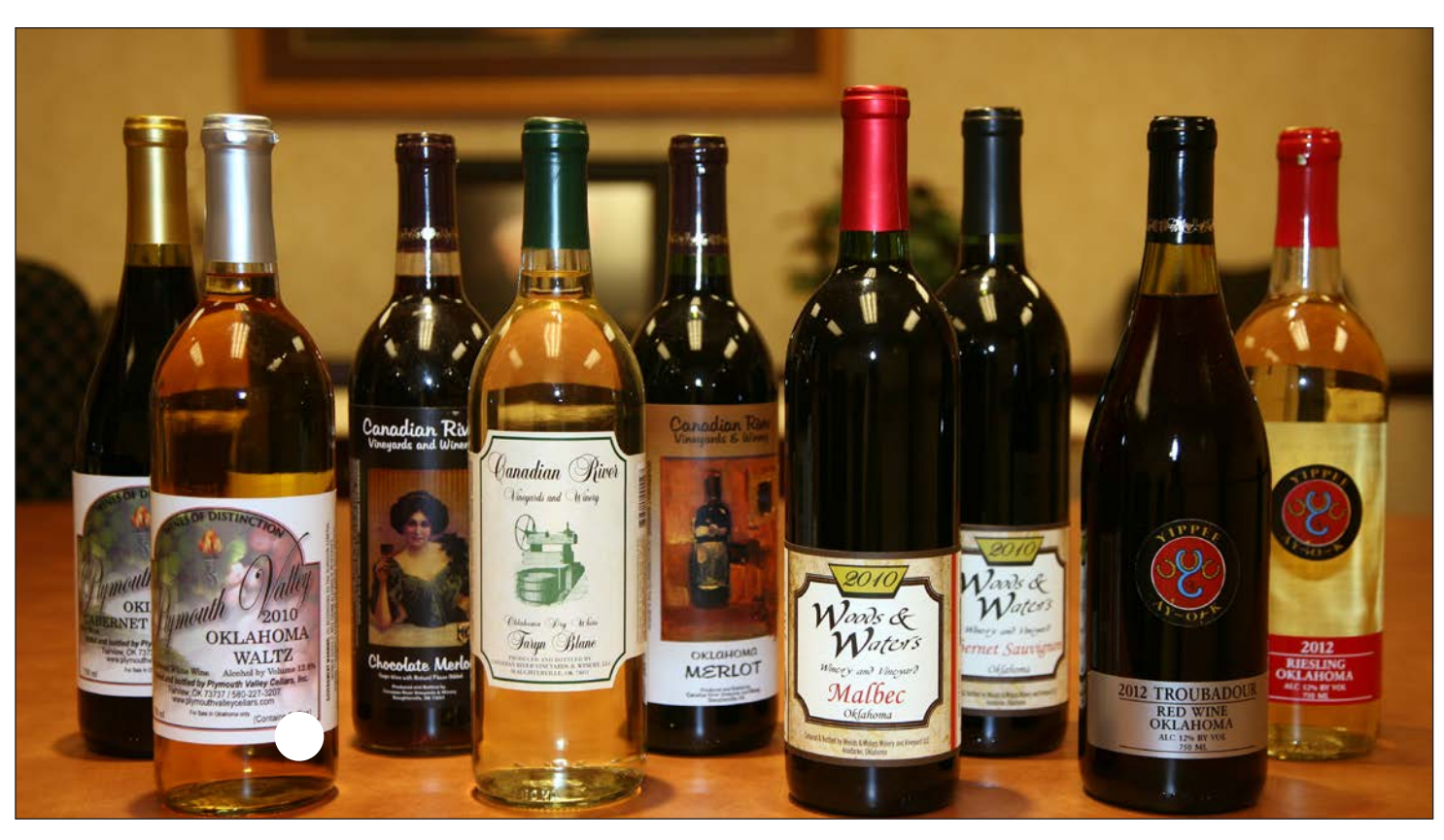
It is projected that during the next few years, Oklahoma wine sales will increase to 5 percent or more of the state's total wine sales, adding at least 100 new jobs and retaining 250 existing jobs in rural Oklahoma and adding an additional $558,000 in taxes to the Oklahoma economy.

"The four primary elements that promote high fruit quality in the vineyard are selecting the proper cultivar, having a suitable environment for