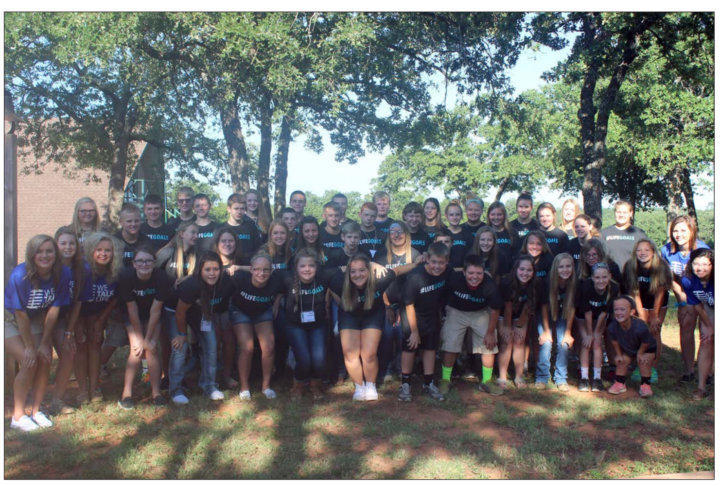
The 2015 AFR/OFU Leadership Summit took place at Camp Big Cedars near Wanette, Okla., July 26 - Aug. 1. Summit kicked off with Teen Session and ended with Senior Session and a new AFR/OFU Youth Advisory Council. This was the second year for the summit to be at the more centralized location.