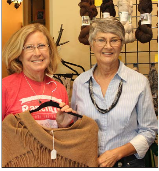
Having a great community is one thing that helps build and promote an alpaca farm and fiber business. The close knit group works together to answer questions and solve problems with the friendly animals.

It is important to have a community for alpaca breeding to get a pure quality fiber from the animals. To get the best quality product, alpacas cannot be bred to a color or breed different from their own. Keeping the same fiber color and breed of animals produces a pure product and shows the breeder is a reputable producer of alpacas and alpaca products.