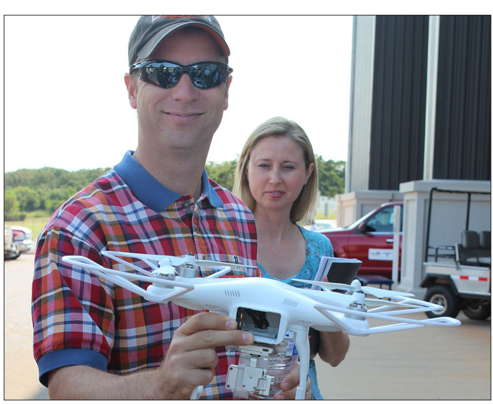
LEAD event-goers got hands-on with the UAV demonstration, by testing weight and getting an up-close look at the new technology.